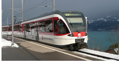
Our own railway station in Niederried

Familie Dori & Hans-Ulrich Schweizer Gartenstrasse 3 CH-3852 Ringgenberg Phone ++41 (0)33 828 14 10 Fax ++41 (0)33 823 40 48 www.schwizi.ch info@schwizi.ch