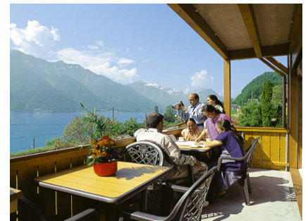
Balcony with lake view