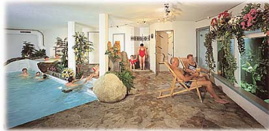
Our heated indoor pool in Ringgenberg hillside

Familie Dori & Hans-Ulrich Schweizer Gartenstrasse 3 CH-3852 Ringgenberg Phone ++41 (0)33 828 14 10 Fax ++41 (0)33 823 40 48 www.schwizi.ch info@schwizi.ch