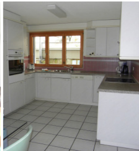
Kitchen with dining area