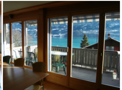
Balcony with lake view